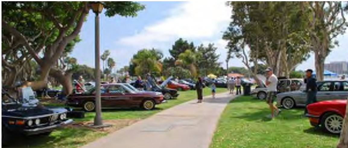
West End on the Green, at the Bay, across from the San Diego Airport