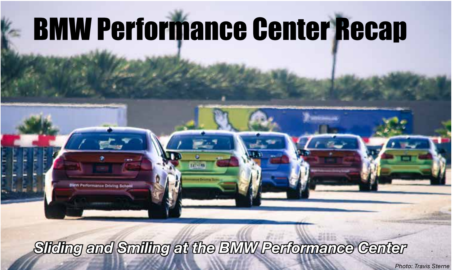
Sliding and Smiling at the BMW Performance Center