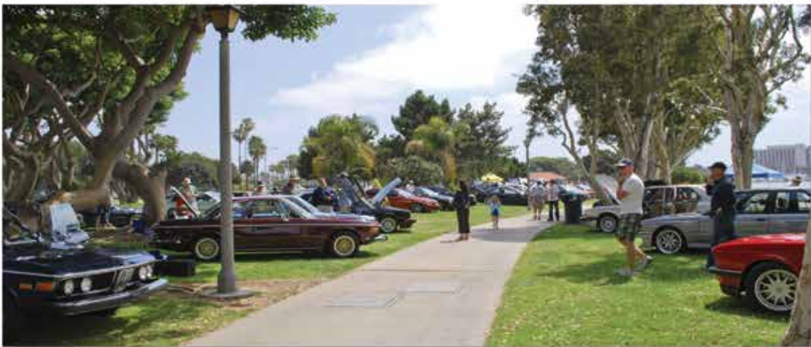
West End on the Green, at the Bay, across from the San Diego Airport