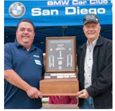
Award