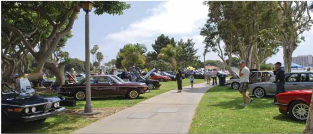
West End on the Green, at the Bay, across from the San Diego Airport